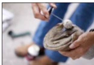
Improves Function of Frog!

exterior against external moisture and contaminants.