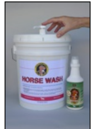
Two Sizes: 32 oz & 5 gal.

HORSE WASH is formulated to lift dirt off the skin without scrubbing. This has shown to cut grooming time in half.